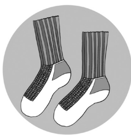
ett par sockor