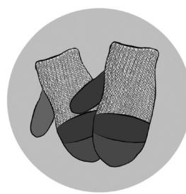
ett par vantar